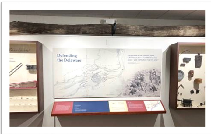
Cheval de Frise Display

The Brandywine Battlefield Park was honored to host part of the PA Museum's Conference 2019 on Sunday, April 7th. The Conference is 3 days of history, workshops, and planning for the future for Pennsylvania History; hosted by the non-profit PA Museums . Brandywine Battlefield offered