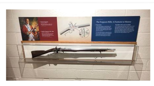
New Display for the Ferguson Rifle

PA Museum Conference attendees also examined our new display for the Patrick Ferguson Rifle (replica). As the first breech loading weapon, this gave marksmen a much higher rate of fire than the average musket. The trigger guard is actually used as a crank to "unscrew" the breech where it could then be loaded with